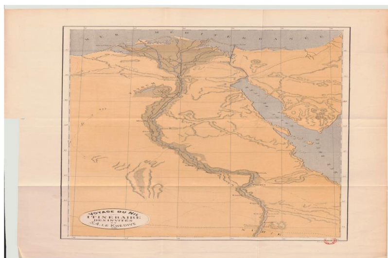
Fig. 2. Map for the guests' voyage.

Mariette's guidebook was distributed to guests upon their arrival and before the start of the journey. Their passage to Upper Egypt took place via steamboat, which did not sail at night out of respect for sudden changes in the Nile's course and the difficulties this might pose. Thus, the ships stopped at night and were anchored to the nearest beach. 53