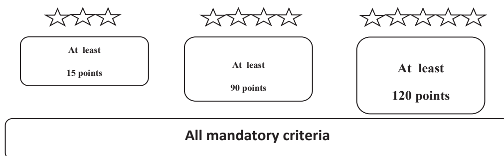
Figure (2): Key Criteria for Environmental Performance , Source (Fritz, 2010)

To receive the Green Star hotel certificate, the hotel needs to accomplish ten environmental (mandatory) key criteria (Zaazou, 2013) which are: