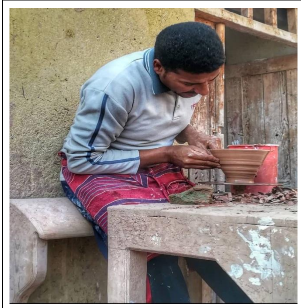
Photo.1 Creative tourism activity in pottery making in Tunis Village.

As previously mentioned in the theoretical part, creative tourism could be applied to various spheres: gastronomy, crafts, design, music, dancing, folk art, festivals, etc. Crafts represent the most employed creative sphere in tourism activities organized by 80 % of the sample size. The other 20 % organize programs related to cookery classes of traditional local food, painting, and folk arts. The following photos represent crafts classes in Tunis Village and Dahshour attended by the researcher during a field visit.