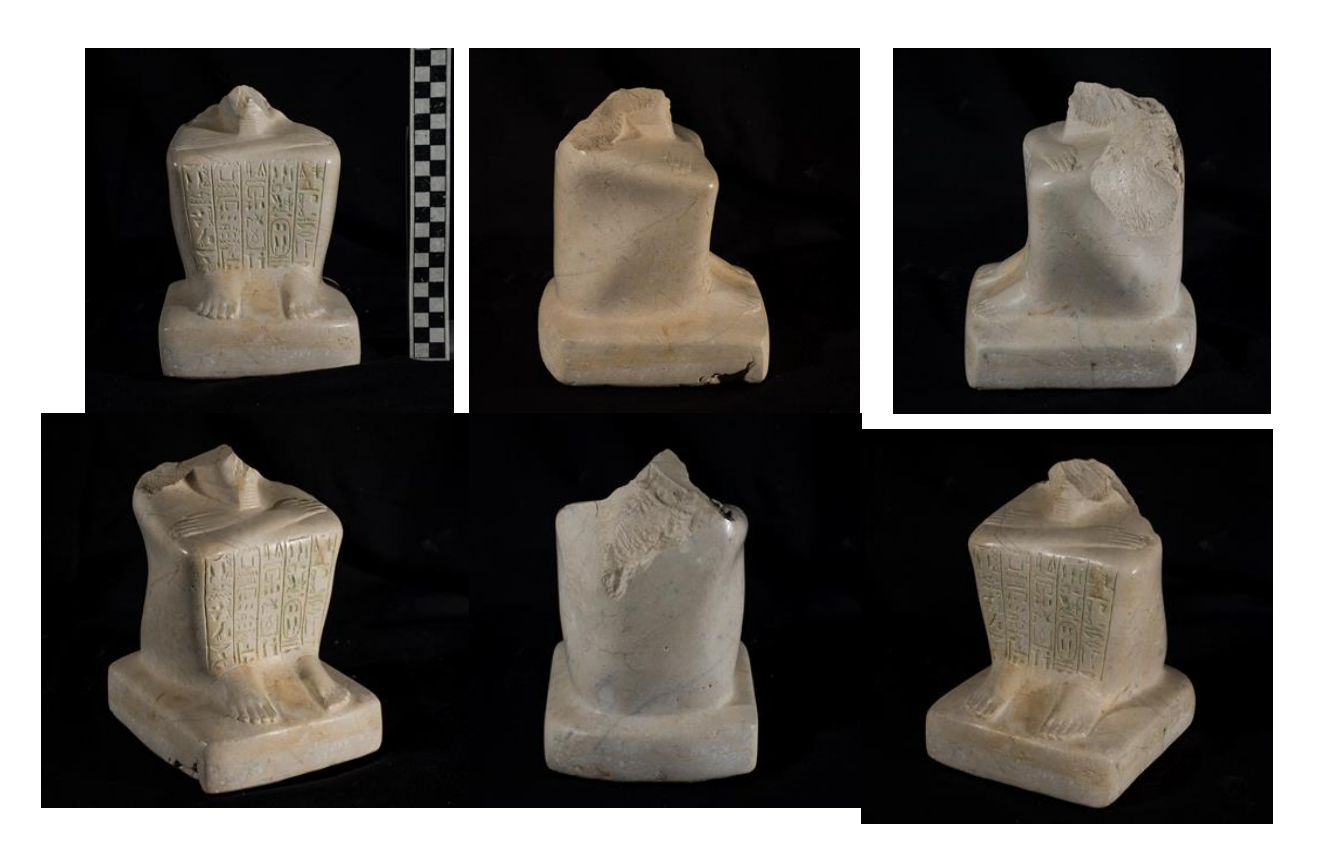
Fig. 1. Block Statue of Heky