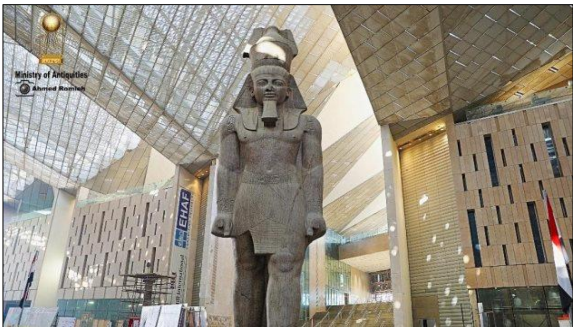
Fig.4. The statue of King Ramses II in the GEM