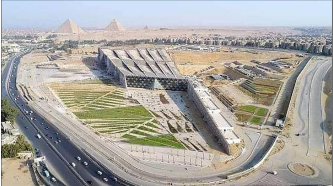
Fig.3. location of the GEM