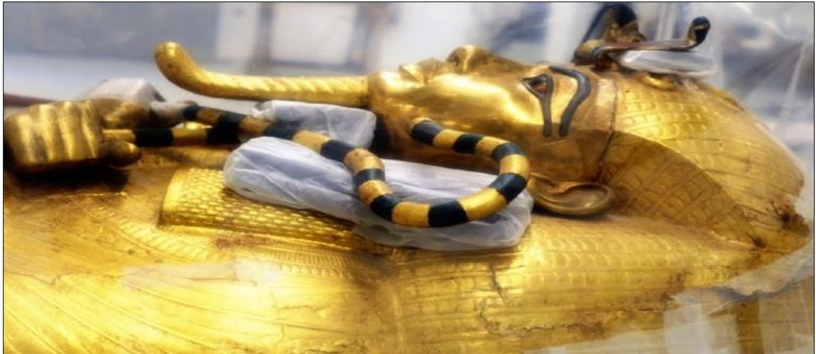
Fig.5. The Tutankhamun collection in the GEM