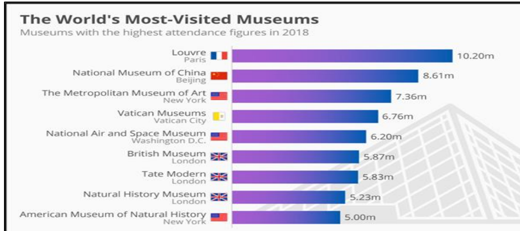
Fig.1. The world's most-visited museums

most-visited museums received a total of 61 million visitors in 2018, figure (1) shows that the Louvre in Paris was the world's most-visited museum, attracting 10.2 million visitors, followed by 8.61 million visitors of The National Museum of China (World Economic Forum, 2019):