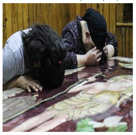
Fig. 6. The celebrants of the moulid raise their prayers while gathering around the burial of Saint Barsum. (2020).