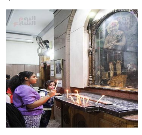
Fig.5. The celebrants of the moulid lightening candles in front of Saint Barsum's icon.. (2020)

During the celebration of mūlid Sīdī al-cIryān, the Christian celebrants express their praises and glorification for the saint by gathering around his burial while holding candles and chanting verses related to his memoirs, miracles and martyrdom (Fig. 5). They ask also ask for his intercession and assistance during their expatriation from earth to their final journey in the eternal life ( 2007، روبير). Moreover, meditation is raised and prayers animate the crowd in order to bring comfort and pleasure amongst the celebrants (Fig. 6). It should be noted that some Christians believe in the apparitions of Saint Barsum al-cIryan on his mūlid . One of the signs of this appearance is the tremolo of the palm trees in the monastery's garden, thus, the Christians keep chanting all night "اهز النخلة ياعريان، (Shake the palm, O 'Iryān; Shake the palm, O 'Iryān), as they believe that the vibration of the palms is an indication of the presence of the saint and the beginning of his appearance (Kamel, 2014). On the other side, Muslim celebrants show their love and reverence for Saint Barsum through lighting candles and chanting to praise and glorify his memory (1980 ،مصطفى).