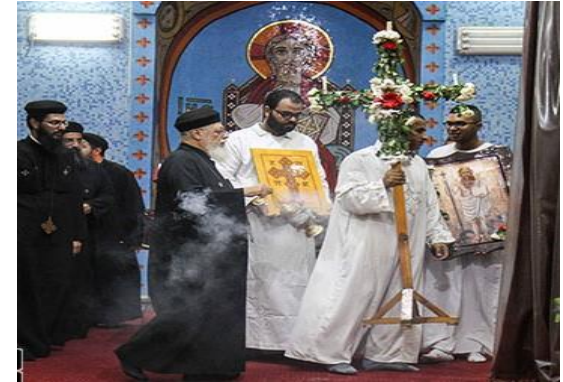
Fig.3. The icons' procession of Mūlid Sīdī al-ʿIryān. (2020 علام).

food and processions, is one of the five main domains in which the intangible cultural heritage is evidently manifested worldwide 2003). Many (UNESCO, folkloric processions were inscribed on the UNESCO Representative List of the Intangible Cultural Heritage of Humanity, established in 2008, with the intention of strengthening the community's link to its history and its future and help raise awareness of the importance of intangible cultural heritage as an expression of human creativity and cultural diversity (UNESCO,