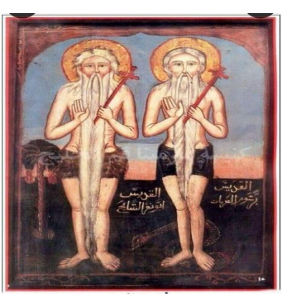
Fig.2. The icon of Saint Barsum in the church of Saint Mercurius.