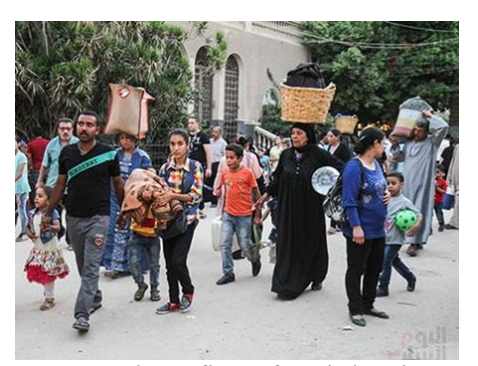
Fig. 7. The influx of mūlid Sīdī al-'Iryān 's celebrants with their supplies. (2020 (علام)).

Apart from miracles and apparitions that are expected to happen, m\bar{u}lid\ S\bar{i}d\bar{i}\ al\ clry\bar{a}n implies a lot of secular joys and social activities and gatherings. The celebrants of m\bar{u}lid\ S\bar{i}d\bar{i}\ al\ clry\bar{a}n come from far villages and nearby districts, with their supplies (Fig. 7), and reside in tents surrounding the monastery (McPherson, 1941). During the celebration, various services take place inside these tents where different types of free food and drinks are served to the celebrants. Additionally, the monastery's monks and nuns provide the poor celebrants with free meals, drinks and first aid. The expenses of these free