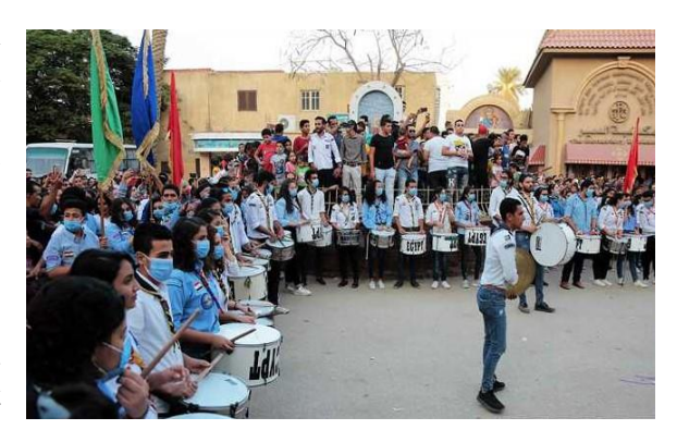
Fig. 8. The performing arts during the celebration of mūlid Sīdī al- ^{c} Iryān. ( ^{2020} ).

On the other side, streets are crowded with thousands of people who have for the saint's come pray intercession, fulfill their vows and enjoy the recreational activities of the mūlid. Amongst the recreational activities and performances is singing and dancing the folkloric stick dance "al-Tahtīb", which has been inscribed on the UNESCO Representative List of the Intangible Cultural Heritage of Humanity in 2016 (UNESCO, 2016). Moreover, theatrical and pleasurable shows are presented