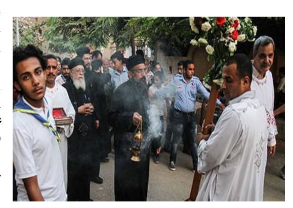
Fig. 4. The icons' procession from the church of Mercurius towards al-Tawḥīd mosque. (2020 علام).

procession, after being anointed with the Meron oil, carried by the deacons of the church who hold floral crosses and incenses and move to the sanctuary (Fig. 3). The whole parade is followed by men and women celebrants ululating and cheering saying: " عم يا عريان يا طب الأفاعي عم يا عريان يا طب الأفاعي عم يا طب الأفاعي التعبان...عم يا رفاعي يا طب الأفاعي Origācī, O medicine for tiredness ... Uncle, O Rifācī, O medicine for snakes), together with other Christians hymns. Meanwhile, in anticipation of good fortune, the celebrants show their interest in touching and kissing the saint's icons and shrine and imbibing themselves with blessings.