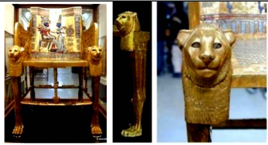
Figure (2): A Throne with legs shaped as lion's paws and face, Tutankhamun's throne Period: New Kingdom Reserve Place: Egyptian Museum Material: Wood Dimension: H. 104 cm – W.53 cm After: Ibrahim, A., "The Throne of King Tutankhamun, 2015, 6-7.

2- The Legs of thrones were shaped as lion's paws and face (Fig.2) The researcher found that the lion's paws and face were depicted within thrones designs to symbolize the lion shape. This type of thrones were used by the king and his family only<sup>29</sup>, it was used in mundane life<sup>30</sup>.